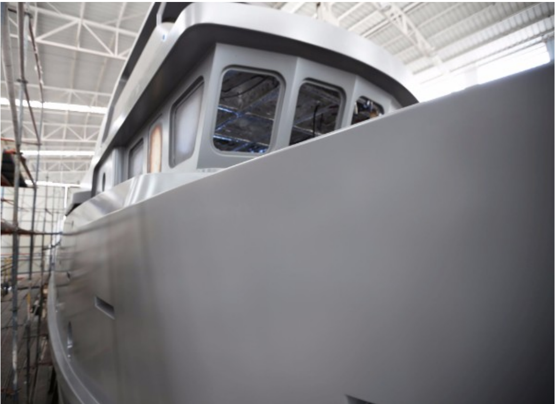
Bering 65 Golden Mile under construction