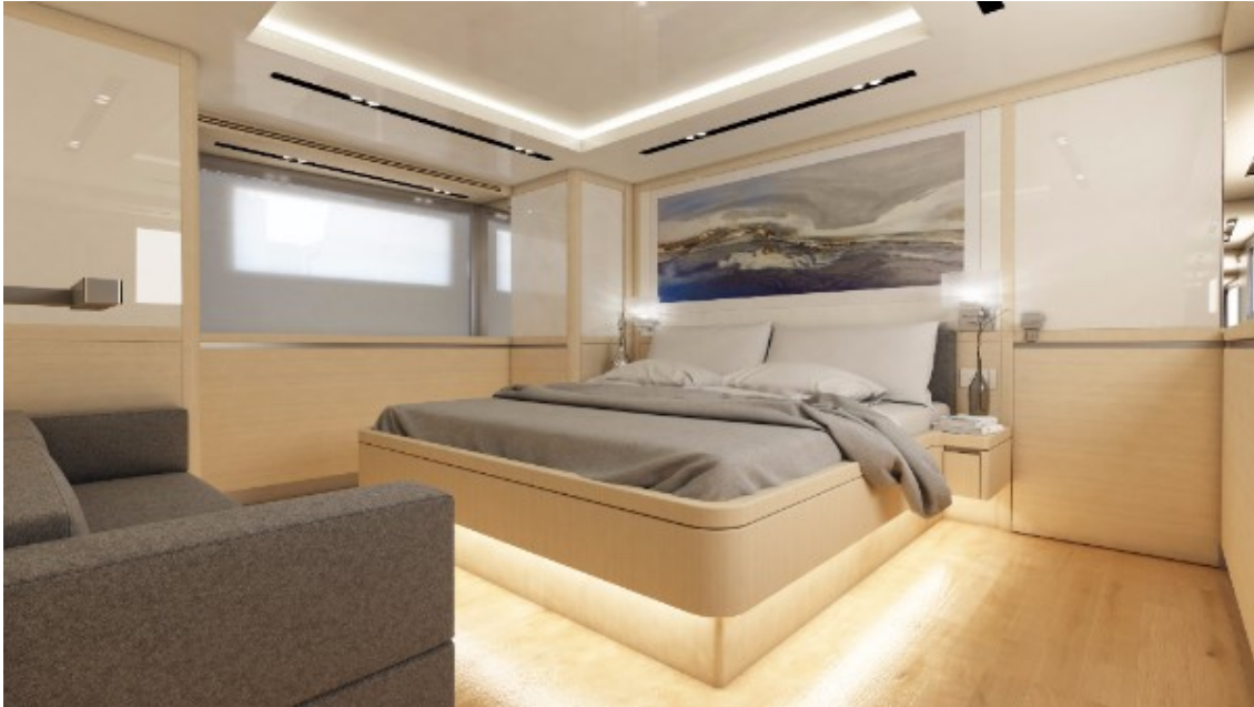
Bering 70's master stateroom concept design