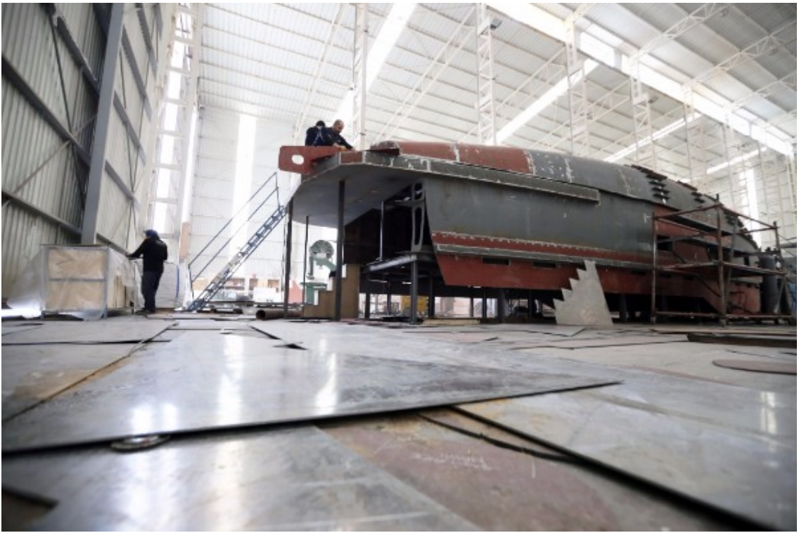
Bering 70 Apsara under construction