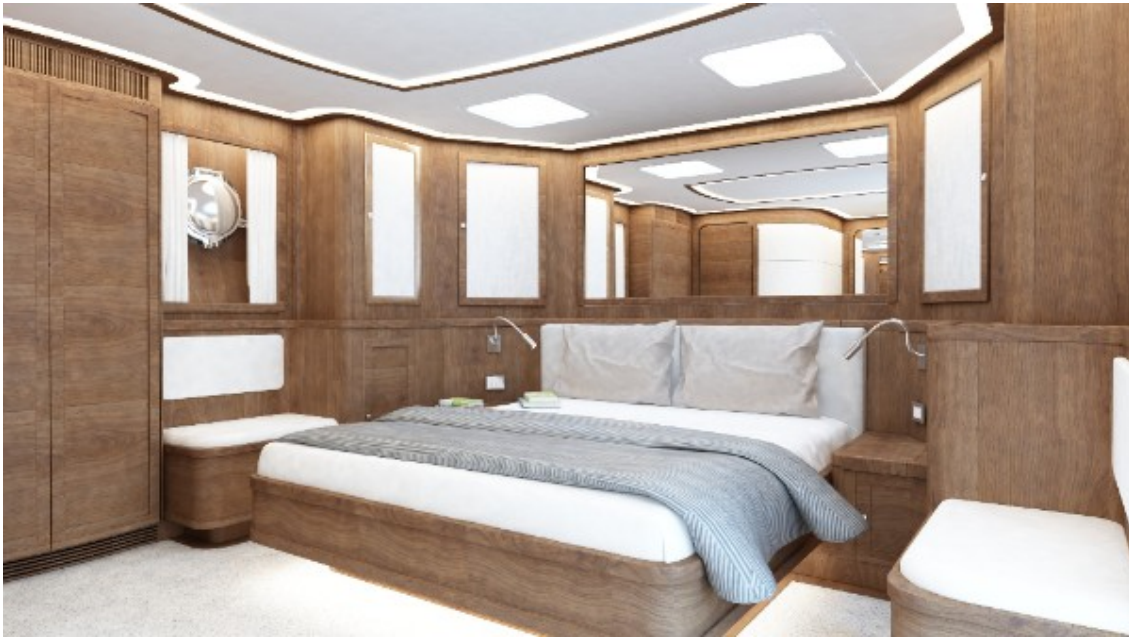
Bering 65 Golden Mile master stateroom concept design

The new build Bering 70 Apsara is also taking shape at the the Bering Yachts facility in Antalya, Turkey. Featuring a steel hull and an aluminum superstructure, she has been designed with the Mediterranean coastal cruising lifestyle in mind.